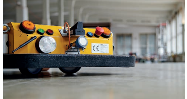
// Intelligent Navigation for Driverless Vehicles: KINEXON Brain with Sensor-Based Positioning Implemented in a Kontron IoT Gateway

Today, the KBox is an integral part of KINEXON Brain and functions within the solution as a control computer that merges the different sensor data of an AGV. The system reliably supplies all required data even in continuous operation as well as with limited cooling and contamination. Thanks to its compact design, Kontron's KBox is also suitable for integration into flat, autonomous industrial trucks. This is an important aspect, as the space available for such an AGV is very limited.